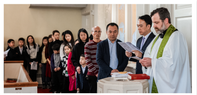
Adults & Children coming to the font

Some of the members of this group joined us from an Independent Chinese congregation, and others are joining us by way of evangelism and conversion. In January of this year 18 people were Baptized (mostly adults, though with a few youths – it was amazing to see entire multi-generational households being baptized, with ages ranging from 80 years old to 7 years old). The following day 30 were Confirmed. To provide for future leadership, we are currently in the early stages of preparing 2 aspirants for postulancy.